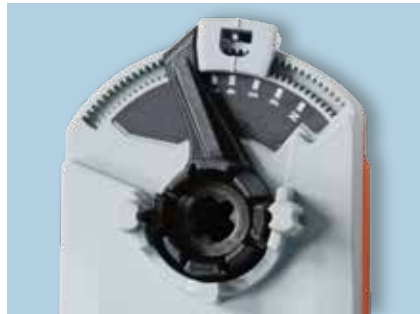
Simple manual k_v setting